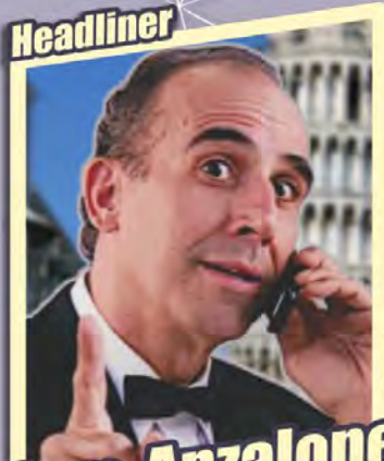
Tom-Anzalone International Musical Comedy Superstar